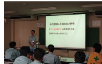
Holding an onsite safety training session at TOPY Industries' Toyokawa Factory

In the future, we will strive to offer comprehensive safety-related knowledge cultivated over many long years by integrating our Group-wide efforts. In this way, we can meet our customers' requirements by providing a diverse range of more advanced proposals. We are also working to enhance safety education for salespeople, who have the closest contact with customers, so that they will be able to provide customers with more appropriate advice in a timely manner.