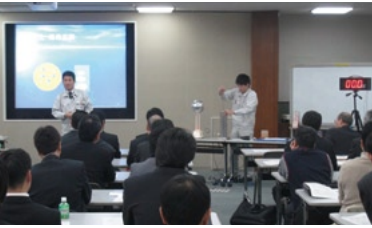
Safety seminar in which many users of industrial coatings participated

Visits to customers' worksites include inspection and advice that takes advantage of the experience that the company has gained through safety patrols for the Group companies, as well as training sessions for static electricity safety. Nippon Paint has also hosted safety seminars in Tokyo and Osaka targeting people from a large number of companies using industrial coatings. These seminars allow participants to learn about the potential risks of spontaneous combustion and preventive methods, while also offering hands-on practice for safe handling of static electricity.